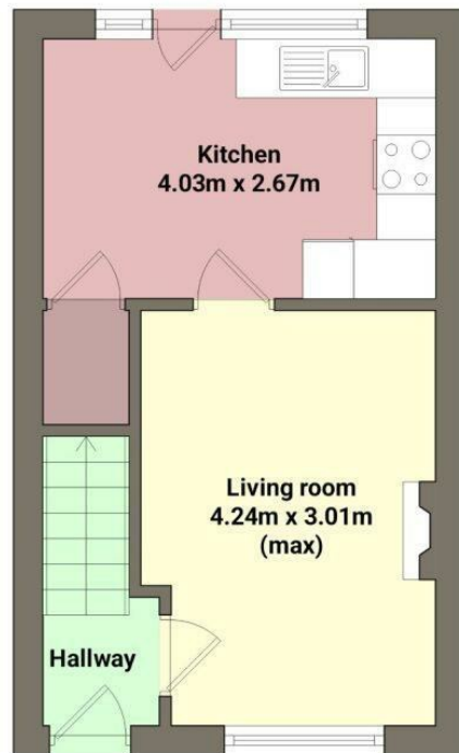
Ground floor Area: 26.98 m 2